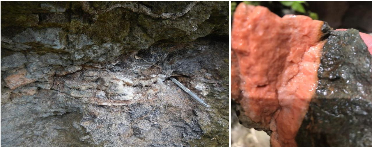
Figure 2: Photos showing different vein styles at Main Ridge, including a quartz-carbonate vein that assayed 13.9 g/t Au (right) and outcrops 560m west of Pennants open pit.